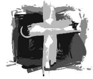
Minute for Making a Difference